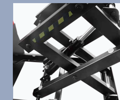
Double scissors structure, rectangular tube profile, more stable and stronger