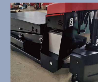
The batteries can be removed conveniently, for easier maintenance and disassembly