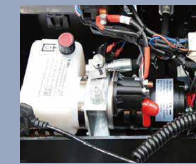
Integrated hydraulic unit, compact structure, less space