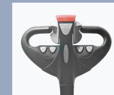
Multi-function handle, reliable, beautiful and simple, all functions can be completed with one hand