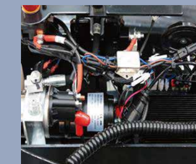
One-piece cover, covering almost all important components, convenient for maintenance