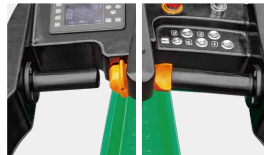
Right and left hand sensing