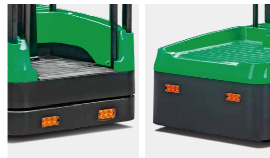
Front and rear flashing lights