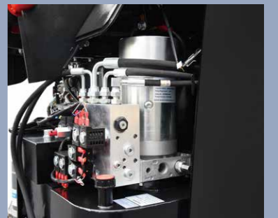
BUCHER hydraulic unit