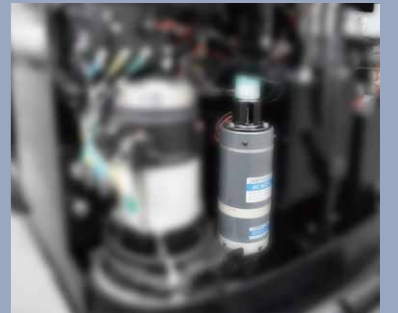
EPS (Electric Power Steering) is standard specification