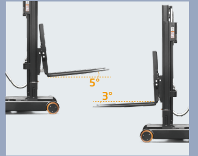
Fork tilt F/R: 3° / 5°