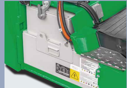
The packs can be easily removed by a manual or electric cart, and can be repaired and maintained conveniently