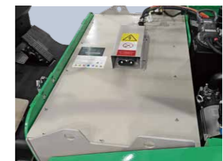
Lithium battery (Opt.)