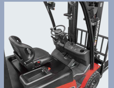
Fully closed operation plate space, tilting cylinder and flat bottom plate, providing more comfortable and safe operation