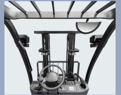
New designed mast and the large open steel roof provide super visibility, it also can reduce risk of accidents