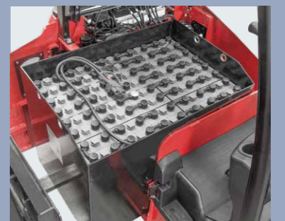
Side roll out the battery can provides the fast, simple and safe solution for the operator