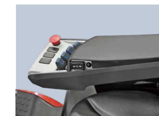
Fingertip system (Opt.)

Note: ● Battery Std. ○ Battery Opt. 2.5Lt:80V