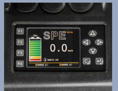
Multi-function instrument with color screen, clear human-computer interaction interface for visualized reading